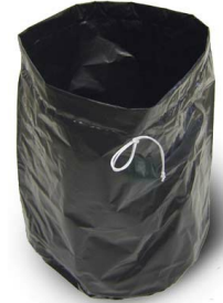
Conductive Polyliner Recovery Bag - Optional