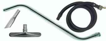
Ø1.5" (Ø38mm) Static Dissipative Tools and Accessories - Included