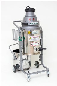
C-35L EX DT (MFS) with Recovery Tank removed