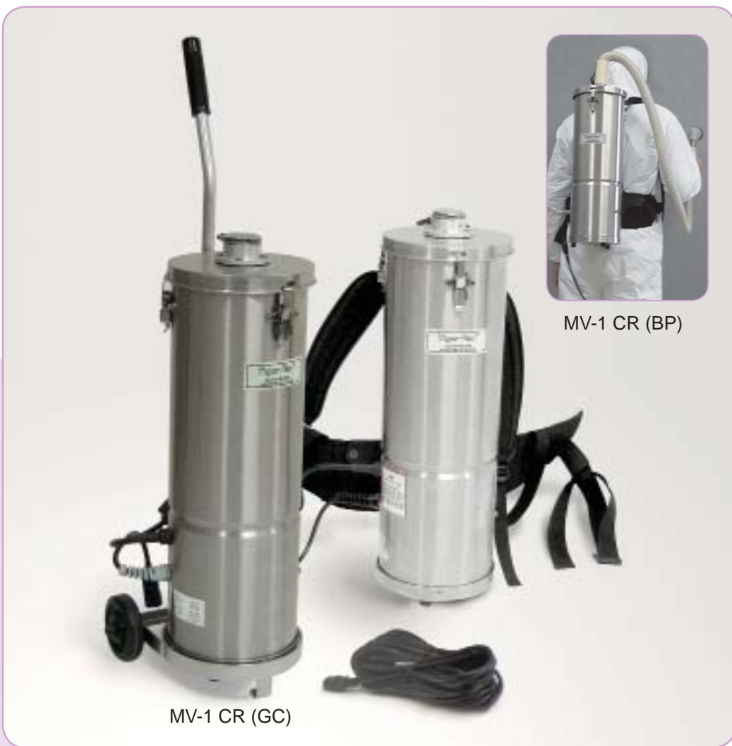
MV-1 CR (GC)