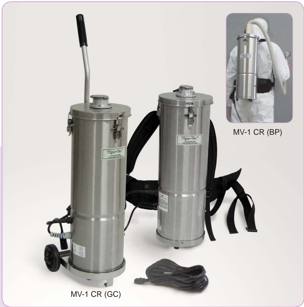
MV-1 CR (GC)