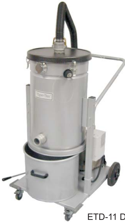
ETD-11 DT (MRP)

INDUSTRIAL VACUUM CLEANER SYSTEMS ELECTRICALLY OPERATED THREE PHASE FOR CONTINUOUS DUTY MODELS ETD-11 DT (MRP) and ETD-11 DT (MFS)