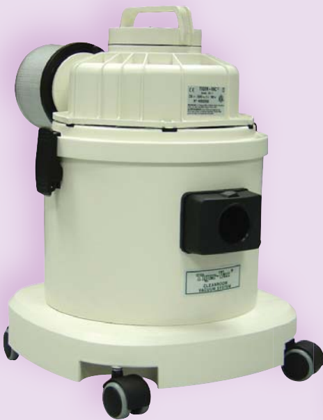
Top: Poly recovery tank Right: Stainless steel recovery tank.

ELECTRICALLY OPERATED CLEANROOM VACUUM CLEANER SYSTEM MODEL CR-1 ULPA (suitable for Pharmaceutical applications)